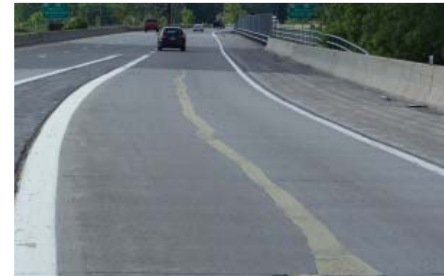
Mid-panel crack repair