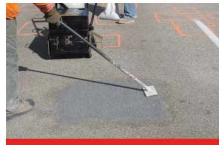
Bridge deck repair