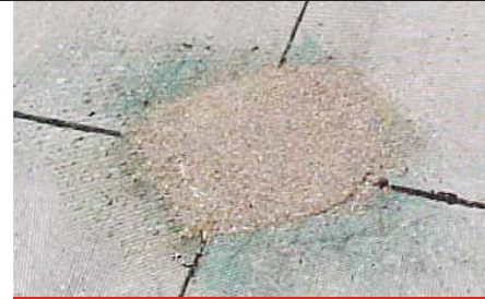
Four-corner, corner break repair